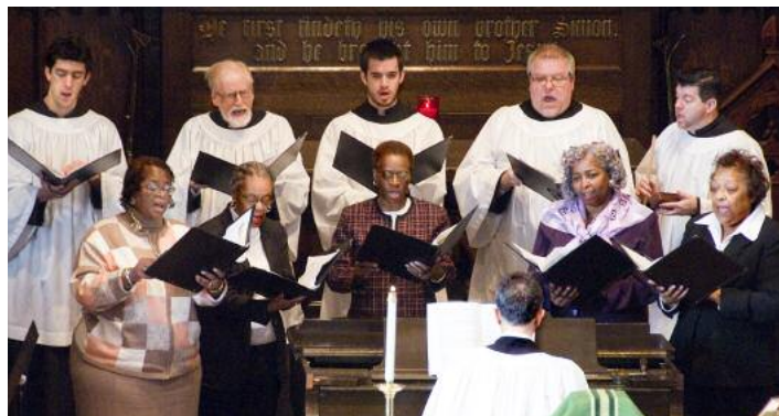
The ECW's "Troubled" Choir (a pun on "Treble" Choir), performed on Sunday, October 19, aided by men of the Adult Choir.

Francis of Assisi instituted the custom of the nativity scene. After receiving permission from the Pope, he erected the first one during the Christmas of 1224 in a cave outside the town of Greccio in Italy. It was not a handcrafted display, but a live scene. When people gathered to watch the spectacle, Francis stood in front of the manger and would recite the Gospel relating to the scene; then he would deliver a sermon.