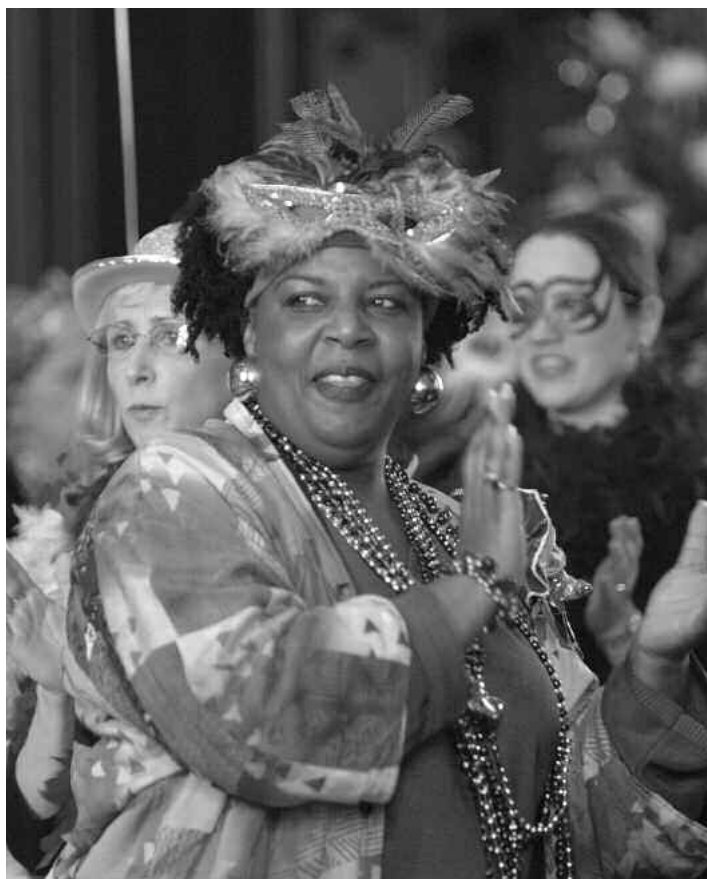
Carnival Sunday 2005